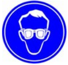
Tightly sealed goggles